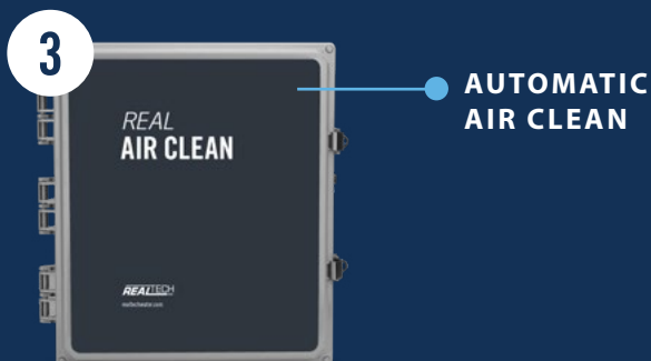
AUTOMATIC AIR CLEAN