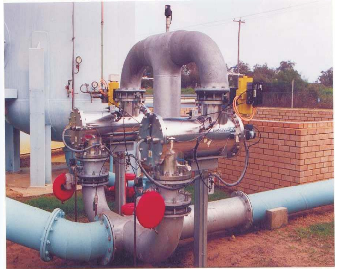
UV Disinfection Installation at Busselton, Western Australia

UV disinfection is used extensively and increasingly throughout the world and by most major water companies in the UK.